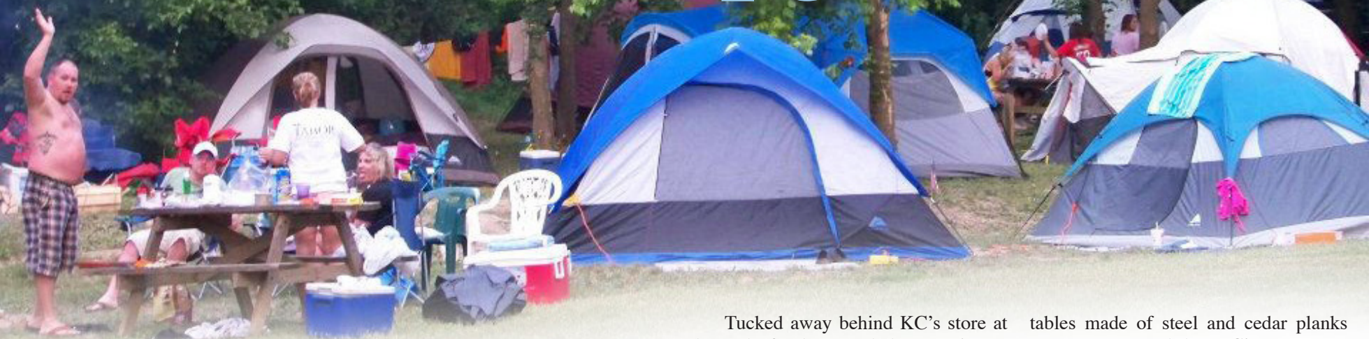
Beautiful 30-unit campground just off Current River's edge